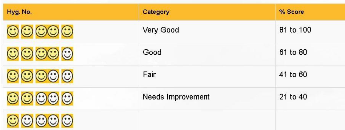
FSSAI Hygiene Ratings Scheme.

Ratings are displayed in the form of symbols i.e. Smileys. This scheme encourages food businesses to ensure high standards of hygiene and sanitation and allows consumers to make informed food choices. This scheme is currently applicable to restaurants, cafes, bistros, fine diners and other eating-places, sweet shops, bakeries and meat shops. It will